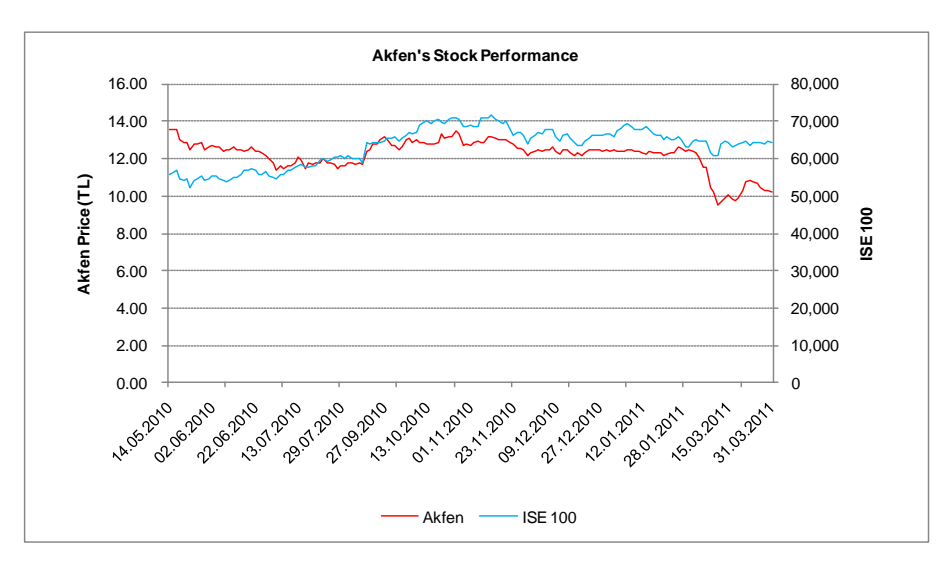
As of 31 March 2011, Akfen Holding's market cap was realized as USD 970.8 million.