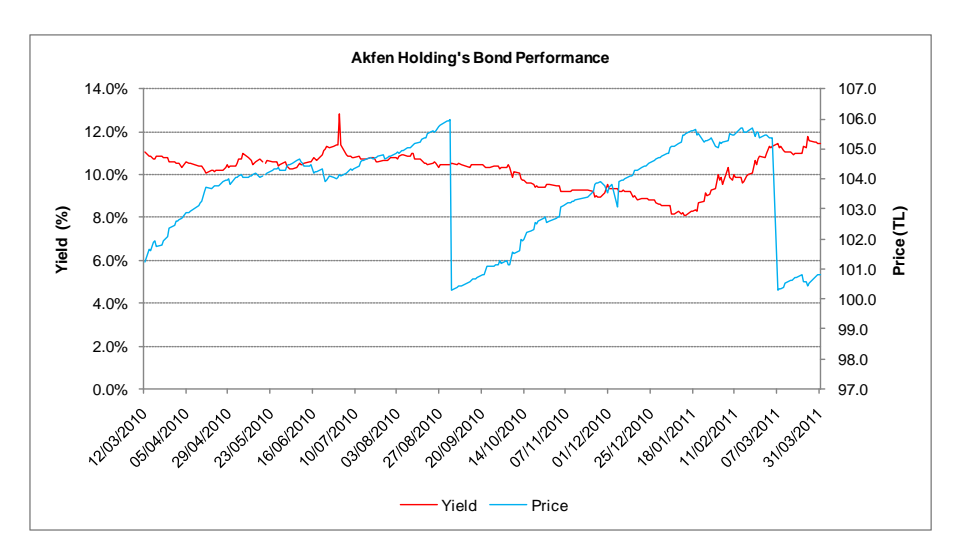
As of 31 March 2011, the issue price of Akfen Holding's bond was TL 100.8. Total trading volume in March was TL747.7 thousands. As of 31 March 2011, the issue yield corresponding benchmark bond (TRT080812T26) compound rate of 9,01% + 233 bps spread.